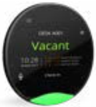
3.5" Desk Booking Screen | DS-0350B