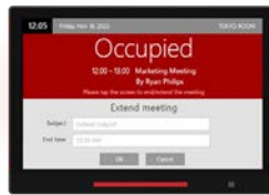
DS-1070 | 10"