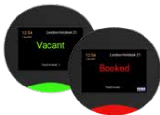
DS-0350 | 3.5" Desk Booking Display

We offer a wider selection of displays. See a selection of our desk booking displays and meeting directory displays below.