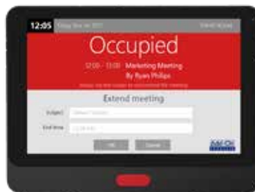
DS-1050 | 10" Room Booking Display

We offer a wider selection of displays. See a selection of our desk booking displays and meeting directory displays below.