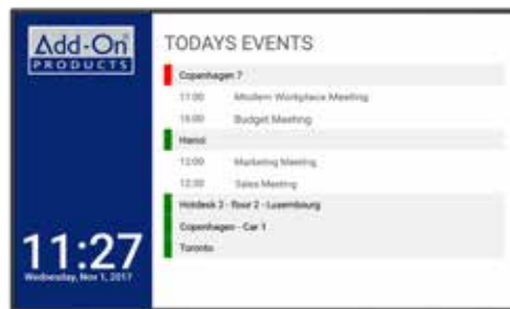
DS-4900 | 49" Meeting Directory Display

Add-On Products® is a market leading provider of add-ons to Microsoft Outlook®, Exchange & Office 365.