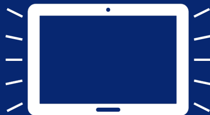
Room Light Status